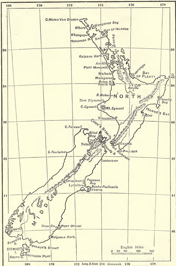
MAP OF NEW ZEALAND, 1837. (Showing progress of settlement up to 1850.)